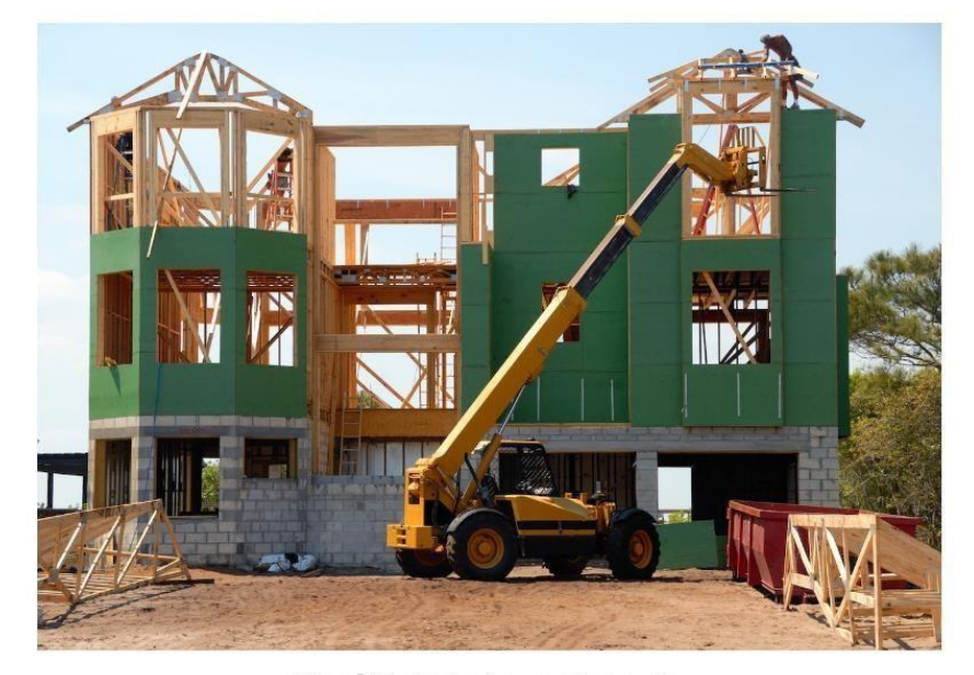
Real Estate Investments