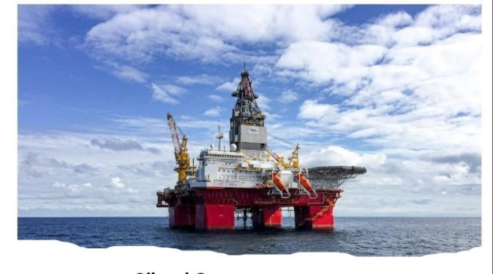
Oil and Gas